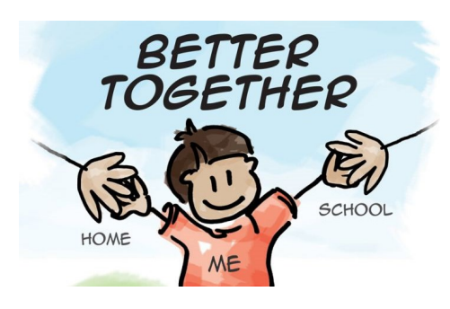
A few polite reminders ...

Mornings - The gates open at 8.30am and the school day starts at 8.45am. If your child isn't in their classroom by 8.45 they might miss the morning register and will need to be signed in at reception. We know things happen on rare occasions but please do try to be earlier than later. Many thanks.