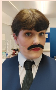
In one of my fun amateur dramatic roles!

Apart from my passion for teaching, I have a few hobbies that keep me busy in my spare time. I thoroughly enjoy amateur dramatics and have been involved in various theatrical productions in the local area. Sewing is another skill I love to explore, and I often create my own unique pieces. Finally, there's nothing quite like relaxing with some crochet – it's a fantastic way to unwind!